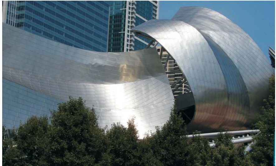
The Jay Pritzker Pavilion, Frank Gehry's conch-shaped band shell.

The Third purpose of Connecting is to foster the above concepts within the ideals of responsible tourism.