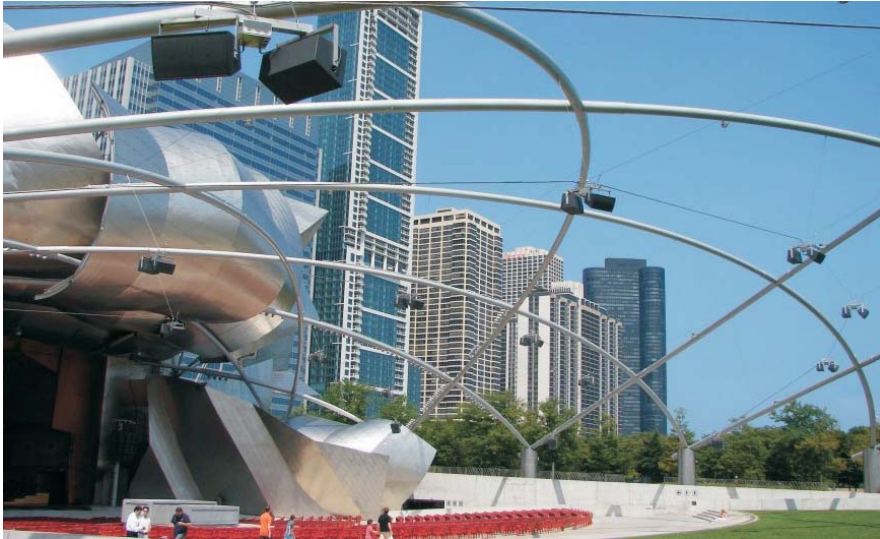
Pritzker Pavilion's revolutionary outdoor sound system mimics indoor acoustics.

After spending the day touring, wandering, and admiring Chicago's skyline, I was duly impressed with this city's grand design but footsore and ready to call it a day. I grabbed a bite to eat and made my way back to my hotel room to rest up for the main event, my first reason for coming to Chi Town.