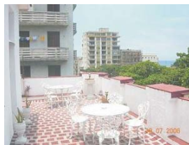
Casa Particular , Havana

✓ Cuba Particular. www.cubaparticular.com .