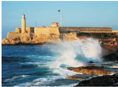
Castillo del Morro, Havana

Baracoa is secluded at the northeastern tip of the island in view of a tabletop hill called El Yunque . Founded in 1511, it was the first Spanish settlement in Cuba and its museum preserves the Parra Cross , which is the only one to survive of 29 crosses that Columbus brought to the new world.